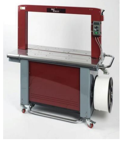
SM65 12MM MACHINE WITH ROLLER TABLES