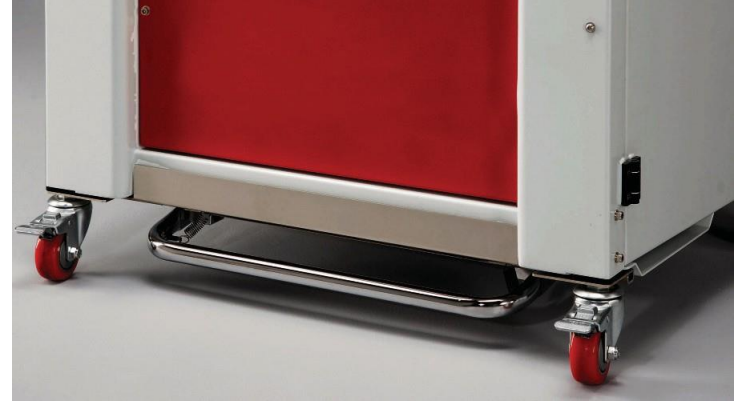
FOOT BAR ACTIVATION