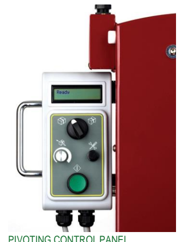
PIVOTING CONTROL PANEL